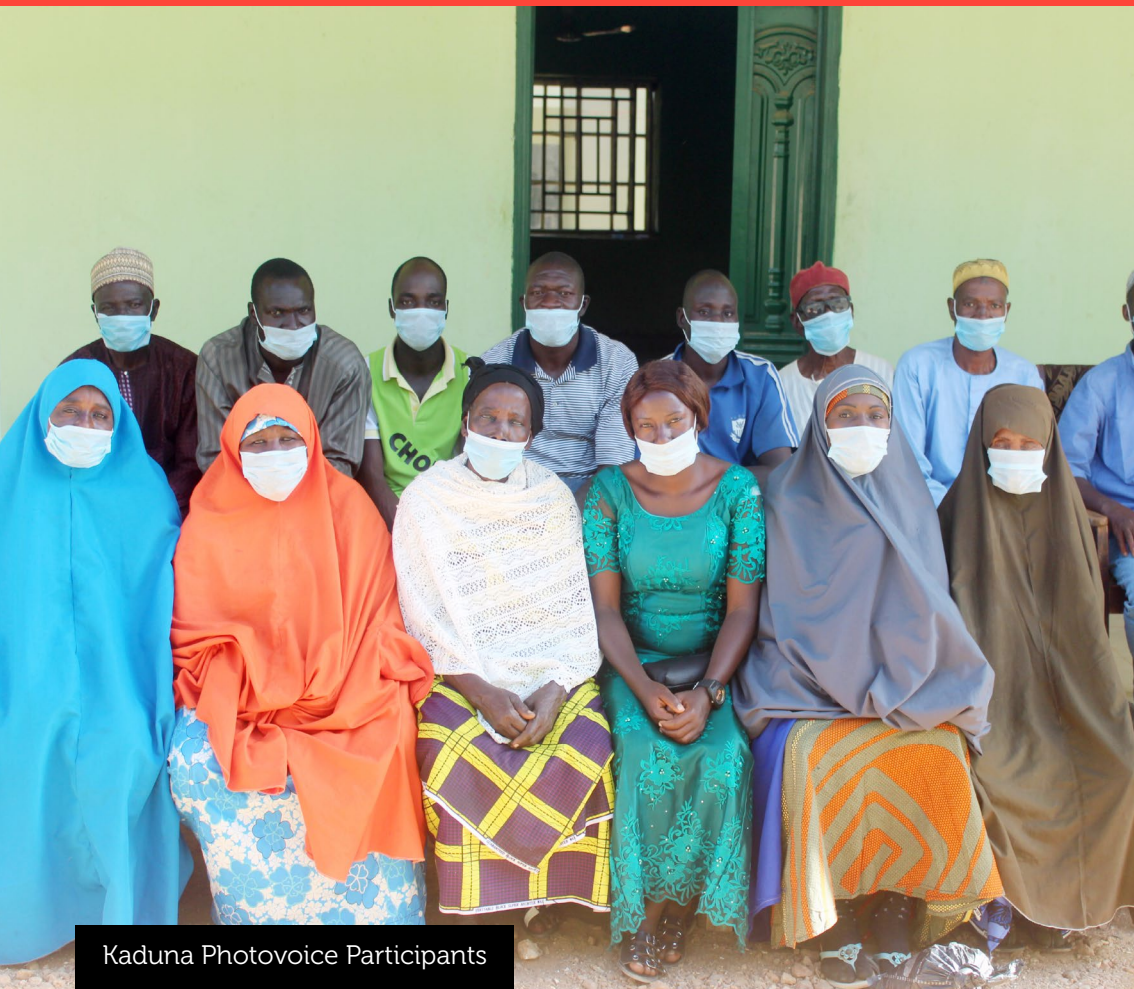
Kaduna Photovoice Participants