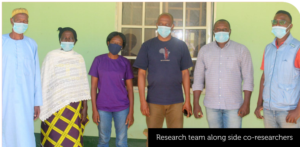
Research team along side co-researchers

'It's been an exciting experience participating in photovoice and having to interact with all the participants I have learnt a lot listening to them and understanding how they have lived their lives in spite and despite their health challenge. I have now gained a new skill with photovoice.'