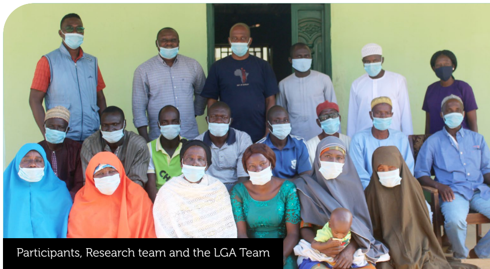
Participants, Research team and the LGA Team

'What I have learnt in this process is living in peace with other people and how I have met with my friends. Before now, I faced a lot of stigmatization even from people who did not know me but seeing me with a camera made the same people treat me differently. People have begun treating me in a positive light because they believe I have gotten a job.'