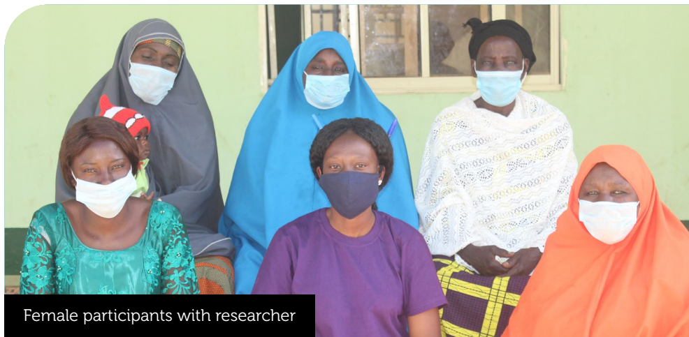
Female participants with researcher

“Taking these photos was a challenging experience, first learning how to handle a camera, focusing it and taking a photo, more so knowing what to take and explaining it in relation to what am going through or facing was a new experience to me.”