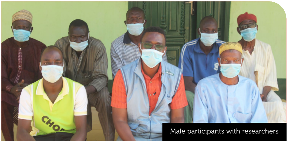
Male participants with researchers

'Being part of the wellbeing team is a learning experience, helping affected persons and caregivers so the world could hear their voices, on what they feel or are battling with through the use of photovoice is a wonderful and fulfilling experience.'