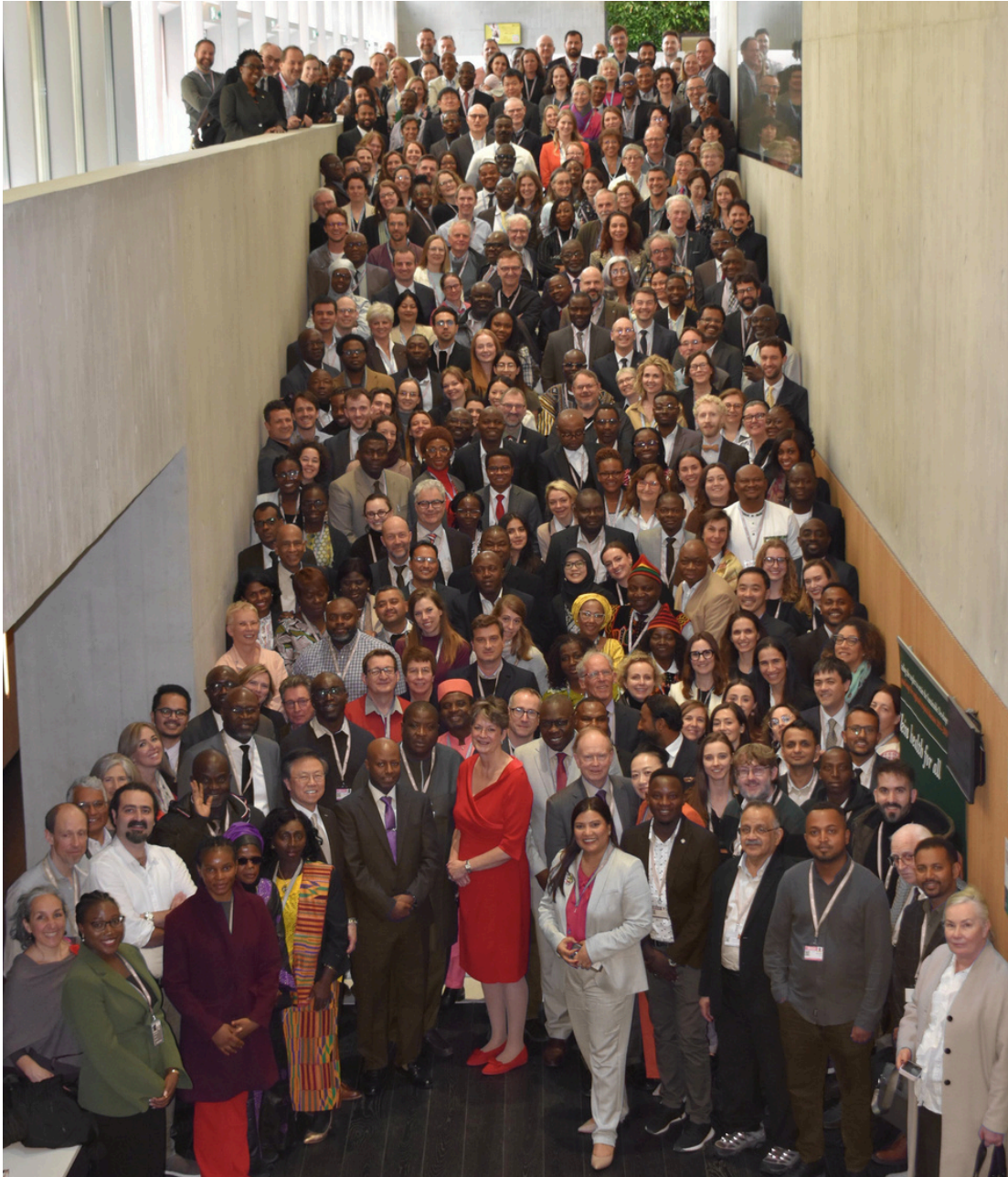
Team Photo from the 2 nd WHO Global Meeting on Skin NTDs at WHO H.Q.